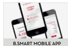
B.SMART MOBILE APP