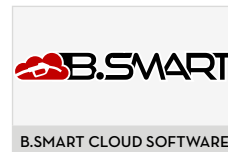
B.SMART CLOUD SOFTWARE