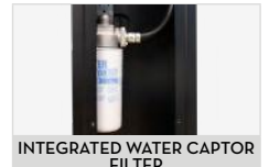
INTEGRATED WATER CAPTOR FILTER