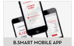
B.SMART MOBILE APP