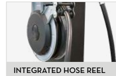
INTEGRATED HOSE REEL